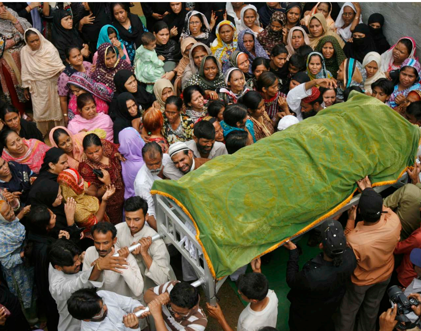
A funeral procession after the fire at Ali Enterprises on September 11, 2012.

WRAP, which has certified more than 10,000 factories in 72 countries, certified Ali Enterprises in 2007, 2009, and 2010. WRAP certification expired at the end of 2011, and Ali Enterprises has not renewed it this year. 93 Instead, Ali Enterprises had been certified compliant with SA8000, a prestigious social compliance standard developed and overseen by Social Accountability International (SAI). More