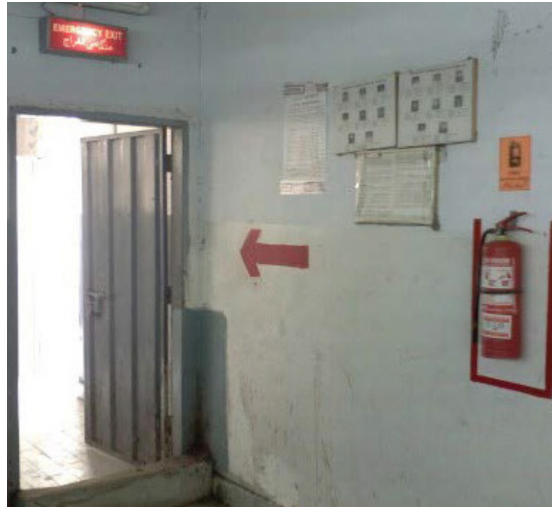
Photo of an open fire safety exit at Ali Enterprises posted by the auditing firm, RINA, on its website ( http://www.rina.org/ ). Another auditor told ILRF that the factory's fire safety exit was opened for auditors, but otherwise locked, with a guard posted in front.

its client, an apparel brand, in 2010 and in 2011. The auditor found several serious “non-compliances,” or signs of danger, but nobody listened to him.