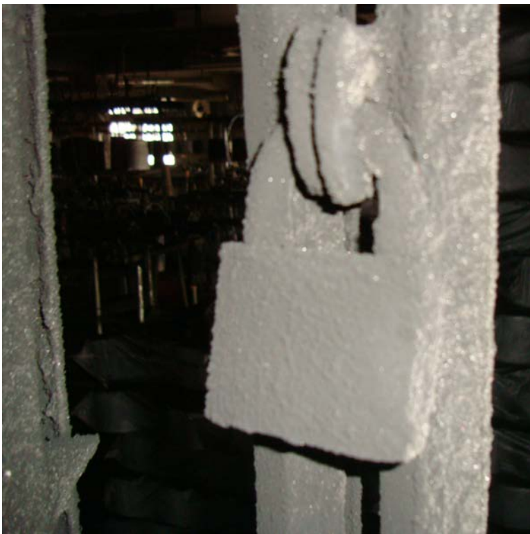
The third floor emergency exit was padlocked at the Garib & Garib factory. Twenty-one workers died in the fire on February 25, 2010.

increasing casualties in garment factory fires. Every garment factory, he said, must have at least two staircases, one for regular use and the other for emergencies. Most factories do have an emergency exit, but the path to the exit is often filled with piles of materials and goods, leading to overcrowding of panicked workers. 85 According to fire service officials, a large number of factories do not have emergency lights that can be turned on without electricity. “This is why the whole factory falls into total darkness during a fire,” said one official. 86 According to a Bangladesh Institute of Labor Studies (BILS) study, most, but not all, factories have fire extinguishers and emergency stairways, but not in sufficient quantity. In addition, BILS reports that, “emergency stairs are kept under lock and key by some employers.” 87 Thus, the horror: workers trapped in the dark, high up in nine to eleven story buildings, with the smoke and the heat coming closer and closer.