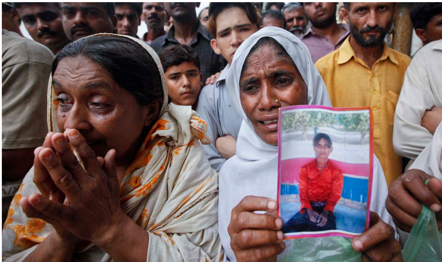
Women mourning a garment worker who was killed in a fire at Ali Enterprises, Karachi, Pakistan, on September 11, 2012.

The last word on this report had hardly been written before the world awoke to the devastating news of at least 259 workers trapped and killed in a factory fire on September 11, 2012. 6 This fire was not in Bangladesh, but in Pakistan, where textile and clothing exports make up about 58% of the country's total exports. 7 Local trade unions have reported that