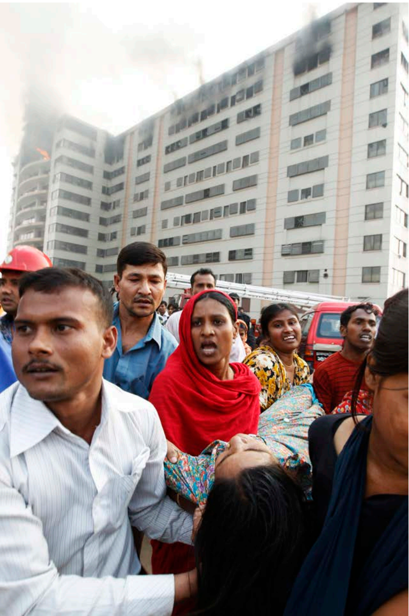
Colleagues rescue a fellow garment worker injured in the fire at That's It Sportswear, December 14, 2010.

It is not that the companies seek to fill corporate coffers with every possible penny. It is that all too often they reject the idea of taking responsibility for dangerous working conditions in their own supply chain and paying reparation for death and injury. Instead, they prefer to contribute to workers' welfare