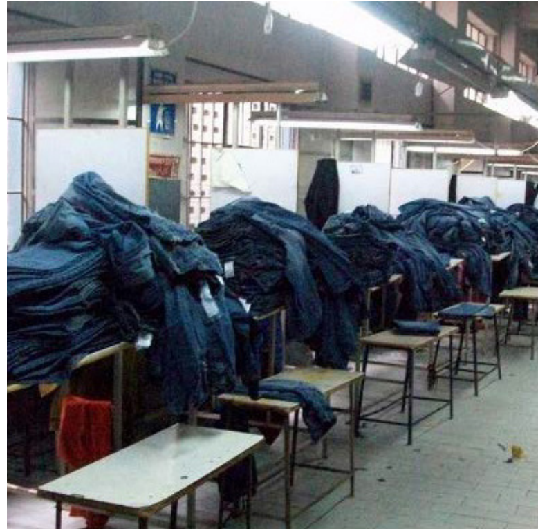
Did the buyers know about the fire risks at Ali Enterprises?

Responsible Sourcing, which offers SA8000 and WRAP certifications among others. UL Responsible Sourcing found that Ali Enterprises failed to meet fire safety requirements in 2007. 104 According to Der Spiegel , Kik had known about “open cable ends, insecure electric equipment, and unlit emergency exits” as well as “overworked and undocumented employees,” but did not tell the workers about the dangers they faced. 105 By the end of 2011 Kik finally received a report that Ali Enterprises had taken corrective action. 106