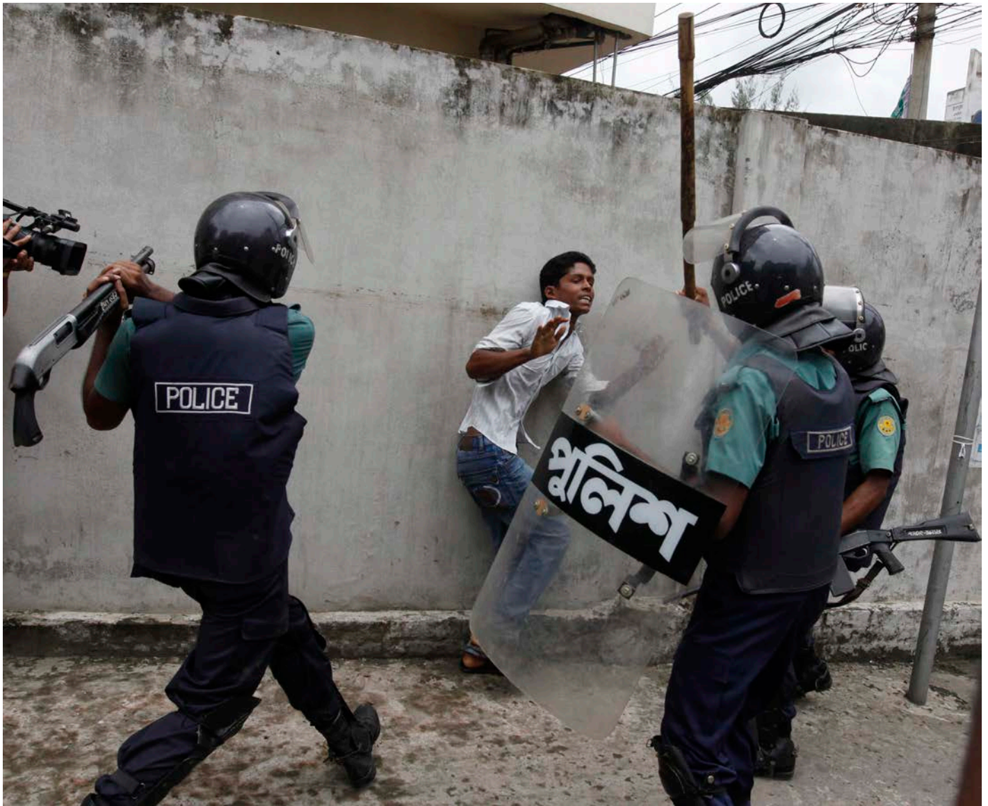
Police officers charge toward a garment worker during a wage protest in Dhaka, July 30, 2010.

in the streets. According to the Center for Policy Dialogue, a private think tank based in Dhaka, the cost of living for garment workers increased by 70% since 2006, meaning that the 2010 minimum wage raise augmented workers' purchasing power very slightly. 139 From January 1 to June 30, 2010, there were an estimated 72 incidents of labor unrest, leaving at least 988 workers injured in clashes with police. In addition to demanding a wage increase, workers protested non-payment of wages, the mistreatment of their coworkers, the curtailment of leaves and holidays, and the sudden closure of factories without paying workers their due wages. 140 On June 30, 2010, children were caught in clashes